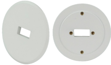
MOFO-PT-TA1B - White